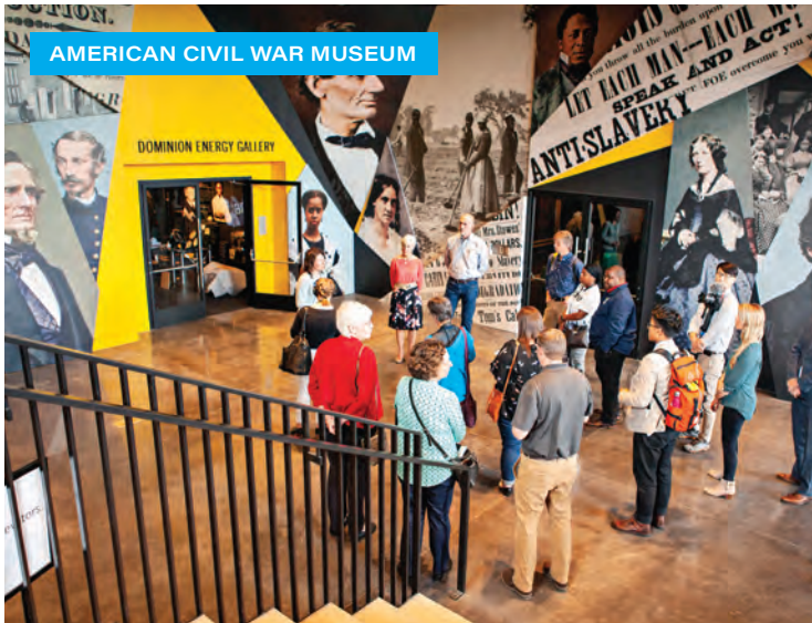
AMERICAN CIVIL WAR MUSEUM