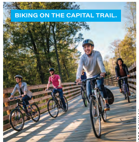
BIKING ON THE CAPITAL TRAIL.

Richmond’s Carytown neighborhood is filled with small, locally owned one-of-a-kind shops. AlterNatives Boutique showcases jewelry, hand-woven textiles and personal and home accessories made by indigenous and woman-owned local and international artisans. 3320 West Cary St., (804) 342-5886, alternativesboutique.com. Beasties features adorable animal-themed clothing, toys and housewares. 3218 W. Cary St., (804) 466-3600, richmondbeasties.com.