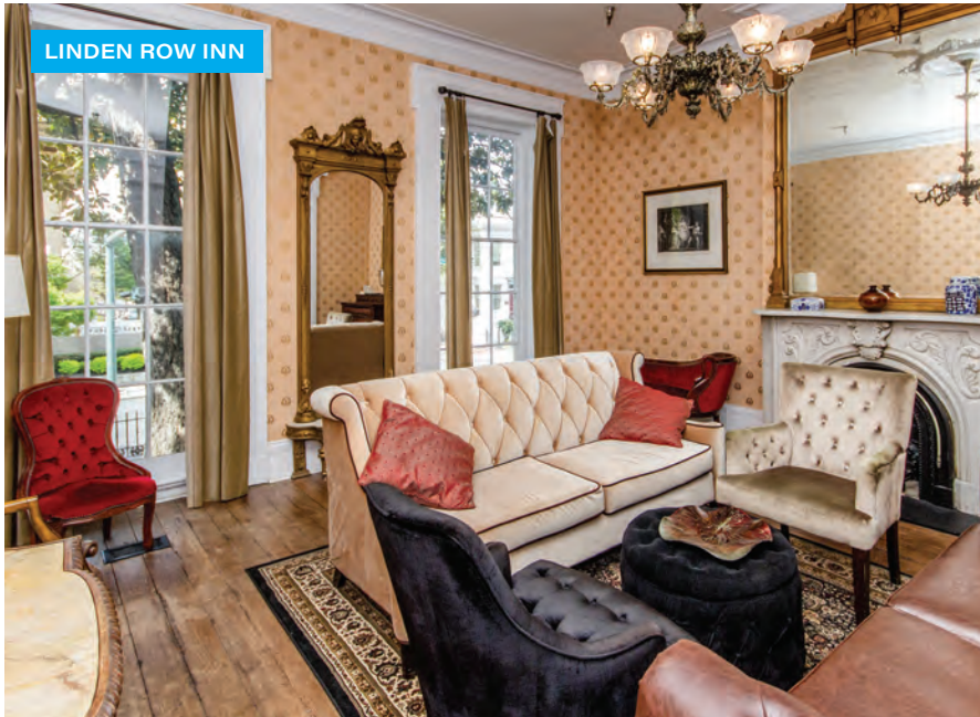
LINDEN ROW INN